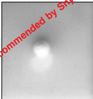
HDLPE exposed 6 months in 16.5% NaOCL. 400 ft. pounds @ -40 degrees F.